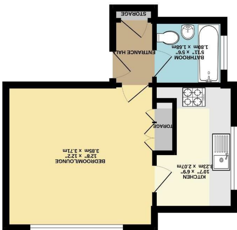
GROUND FLOOR 281 sq. ft. (26.1 sq. m.) approx.

TOTAL FLOOR AREA - 281 sq. ft. (26.1 sq. m.) approx. Measurements are approximate. Not to scale. Measure for your own use.